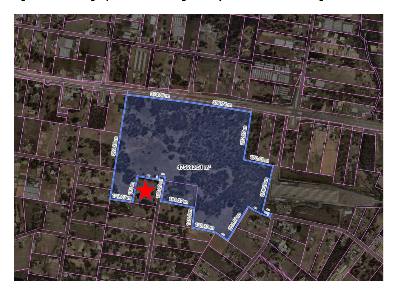
Figure 1 – 565 Bringelly Road Landholding with adjacent Rossmore Stabling Yards

While recognising that the land use planning framework is not advanced at this stage for this site, Vitocco Enterprises has a vision for the site which involves developing a significant mixed use development with a strong emphasis on employment related land uses integrated with a potential railway station on the proposed extension of the South West Rail Link.